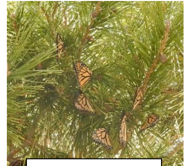
Small clusters Lake Havasu, Arizona

By tagging during the fall migration we have learned some monarchs in the southwest fly to Mexico while others migrate to California for the winter. Most monarchs recovered in Mexico were at El Rosario, traditionally the largest overwintering site in the region. In California tagged monarchs have been found from Camp Pendleton (just north of San Diego) through Pacific Grove in the Monterey peninsula. The largest density of tagged sightings was from Ventura to Goleta to Pismo Beach. In addition small populations of monarchs remain in the lower Sonoran Desert regions surrounding and including Phoenix and Tucson, as well as along the Colorado River in Yuma, Parker and Lake Havasu in Arizona and in Rancho Mirage in California rather than migrating to traditional overwintering sites. To date one monarch tagged in Tucson in early November was seen in early February in Palm Desert, California with Citizen Science sightings reported in the Palm Springs area as well. Tagged monarchs in Arizona migrate to both California and Mexico during the same season and appear to be linked to wind direction and temperature.