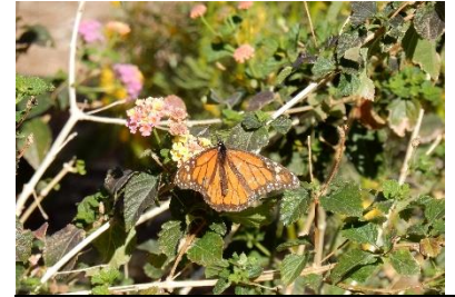
Worn remigrant at Lake Havasu, Arizona. March 2017

Monarchs are reported in Parker and Lake Havasu, Arizona, along the Colorado River in early March and reports begin expanding north and northeastward with confirmed sightings in Prescott in late March and early April, in mid-April at Phantom Ranch along the Colorado River in the Grand Canyon and in Flagstaff in late April in some years. Monarchs also are reported in Las Vegas, Nevada in late March and April and the Reno area by late May and early June. First monarchs appear in southwestern Utah in West Jordan in early to mid-July and the northern and eastern portions of Utah by mid-July to August.